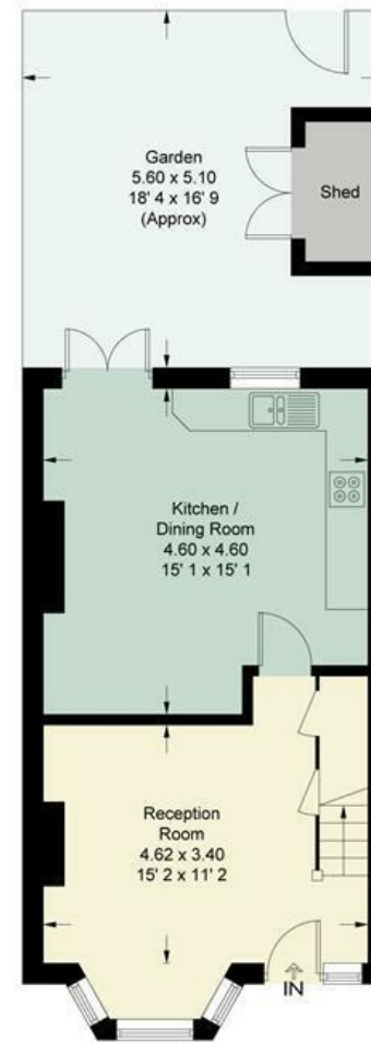
Ground Floor 428 sq ft / 39.8 sq m